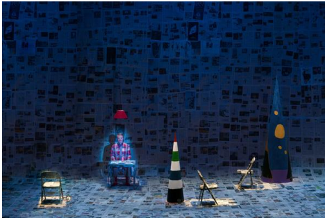
Christopher Knowles, The Sundance Kid Is Beautiful, 2013.