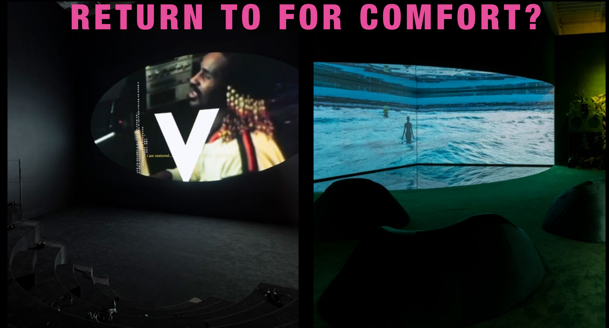
Images (top to bottom, right to left): 1. FTV , 2010-2022. Multiple Videos, single channel projection, rug; 2. FTV , 2010-2022. Multiple Videos, single channel projection, rug; 3. Swimming In Your Skin Again , 2015, 21:32. Video, two channel projection, water, mirror, plants, soundsystem; 4. Univellin , 2016, 15:00. Video, two channel projection, rotating platform, furniture; 5. Swarm Part Zero , 2023, 11:11 Video, two-channel projection, rug, furniture; 6. Blaack Matter and VORTEX Curtains , 2023. 3-D printed "Blaack Matter" Beads. VORTEX print on sheer fabric.